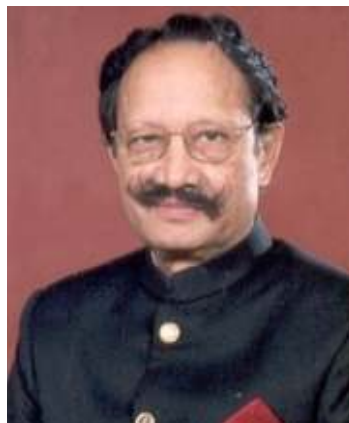
Maj Gen BC Khanduri, AVSM, Retd Chairman Parliamentary Committee on Defence

“I don't miss a single copy of Indian Military Review”