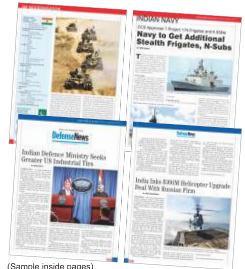
(Sample inside pages)