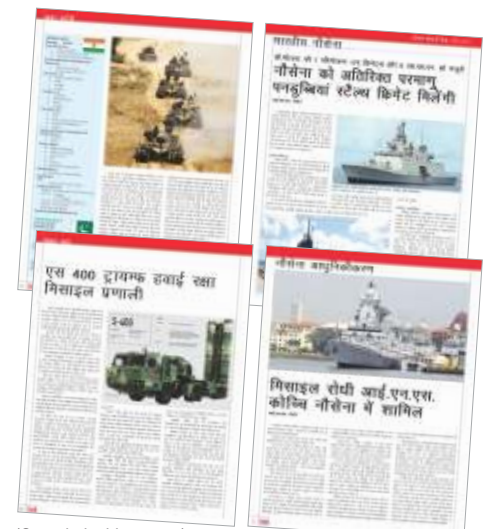
(Sample inside pages)